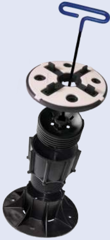
ETERNO ADJUSTABLE PAVING SUPPORT WITH SELF LEVELING HEAD